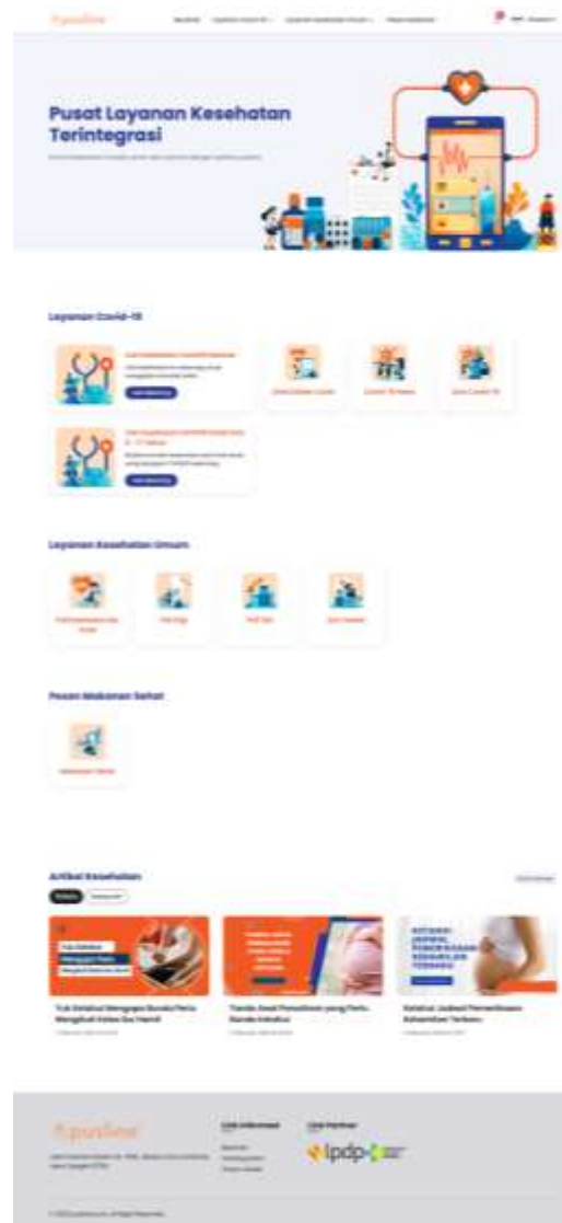
Figure 5. Page Home Telemedicine

In the functional testing stage, it was carried out in three stages, in the first and second stages, system errors were still found, while in the third test, the results of the test showed that all functional features on the telemedicine application menu had worked properly without any errors and bugs. Usability testing uses the System Usability Scale (SUS) instrument which can test the Learnability, Efficiency and Satisfaction of the Pusline telemedicine application. Respondents involved in this testing were 35 respondents consisting of midwifery and informatics.