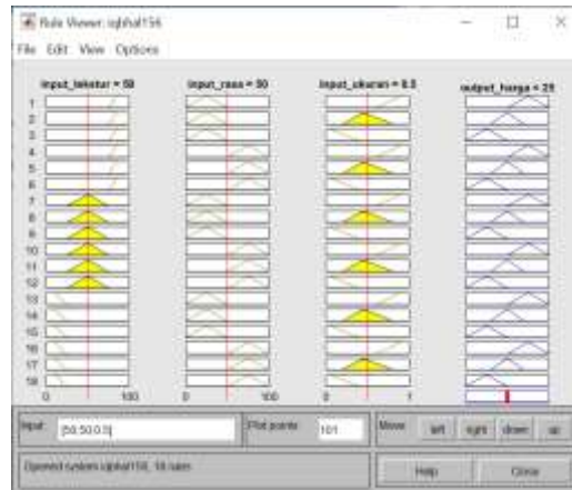
Fig. 5 Mamdani Method Defuzzification

In this study, the centroid approach is applied for defuzzification. By choosing the center of the fuzzy area, a clear solution can be found. Figure 5 illustrates the display of software defuzzification. By entering simulation data in the input column, output will be produced. An example of the input entered in Figure 5 is [50 50 0.5], which means the texture variable input is 50, the flavor variable input is 50, and the size input is 0.5, resulting in an output of 25 for price.