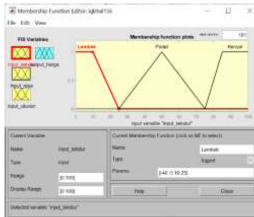
Fig. 1 Input Variabel Tekstur

The following is a texture variable using a trapezoidal curve (for the fuzzy sets Mushy, Solid and Chewy) as shown in Figure 1.