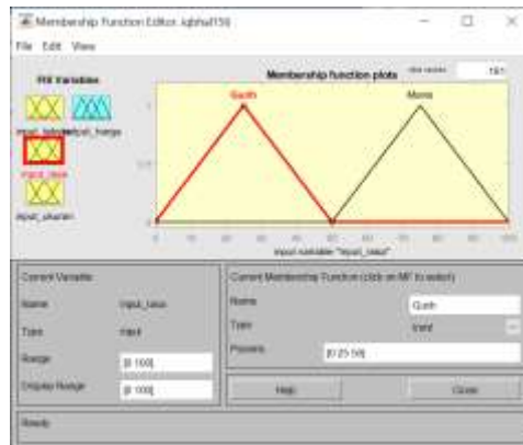
Fig. 2 Taste Variable Input

To represent the taste variables in a triangular shape (for the savory and sweet fuzzy sets) as shown in Figure 2.