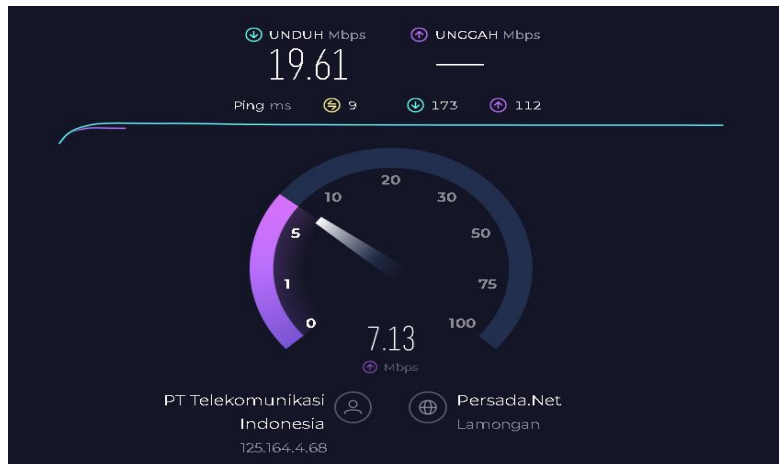
Figure 3. web view from speedtest

Internet Speed Testing Using speedtest.net to measure download and upload speeds at each measurement point. Internet speed was measured multiple times at each point to ensure consistency and accuracy of results. The data obtained was then averaged for further analysis.