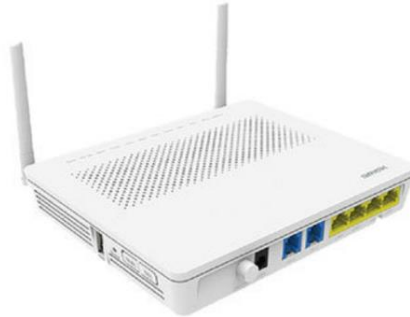
Figur 2. WiFi model type

The study was conducted in various rooms within the home environment to obtain relevant measurement variations. The rooms selected included the living room, bedroom, and kitchen, as they represent common areas of Wi-Fi usage at home. The equipment used in this study included a Wi-Fi router, a laptop/PC with speedtest software for signal strength measurement, and a mobile device for internet speed testing. Proper selection of equipment is essential to ensure the accuracy and consistency of the data obtained.